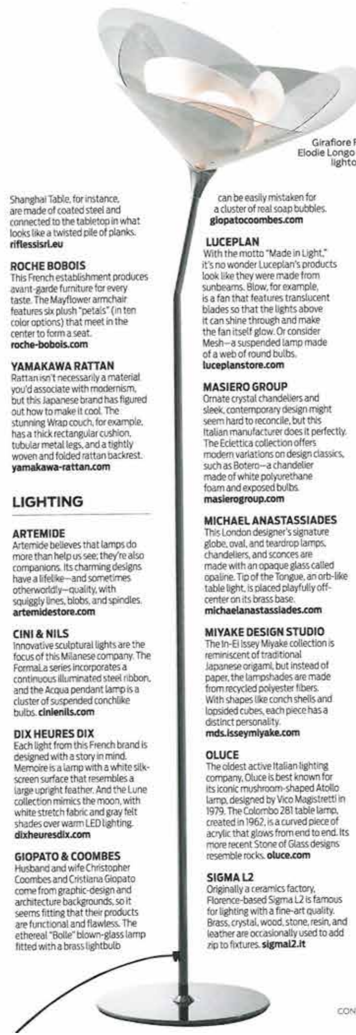
Girafiore Floor Lamp by Elodie Longo for Slamp, $860, lightology.com

The sleek wall-mounted ovens produced by this German kitchen company boast up to seventeen cooking settings and five humidity levels. What's more, these beauties are coated with the company's signature blue enamel, which makes them a cinch to clean. gaggenau.com/us